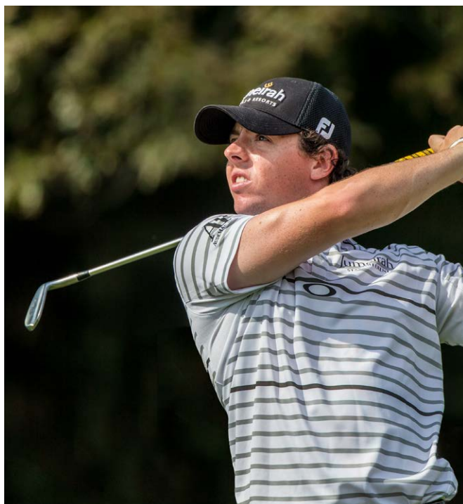
Rory McIlroy hits a shot on Bethpage Black at the Barclays. Farmingdale, NY. August 21, 2012

To add more history to the occasion, this year's event will be held at St Andrews in Scotland, long thought of as golf's spiritual home.