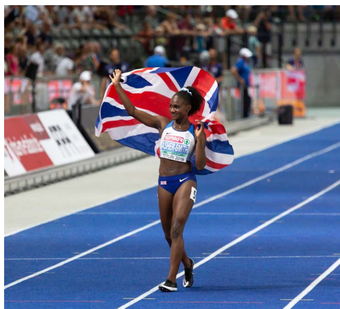
Dina Asher-Smith at the 2018 European Athletics Championships. Berlin, Germany. 7th August 2018

There will be 19 different sports, attracting world-class competitors from 72 different nations.