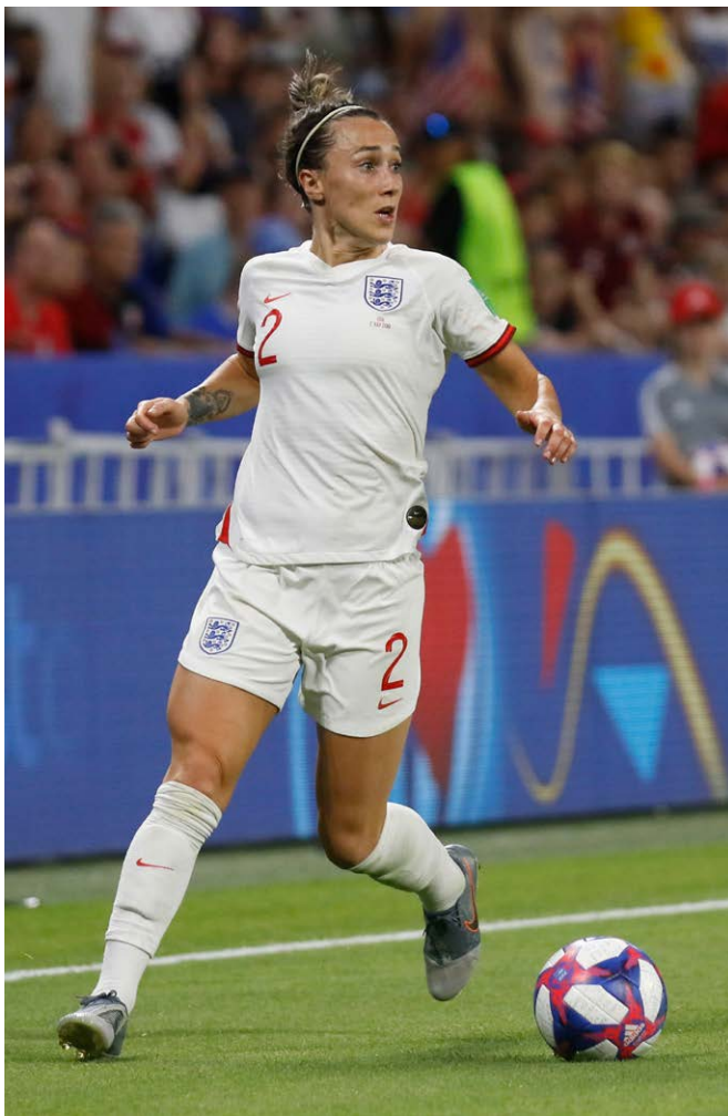
Lucy Bronze during the FIFA Women's World Cup France 2019 semi-final football match England vs USA. Groupama Stadium, Lyon, France. 2nd July 2019

16 teams will compete over a 25-day period, with the final at Wembley on the last day of July.