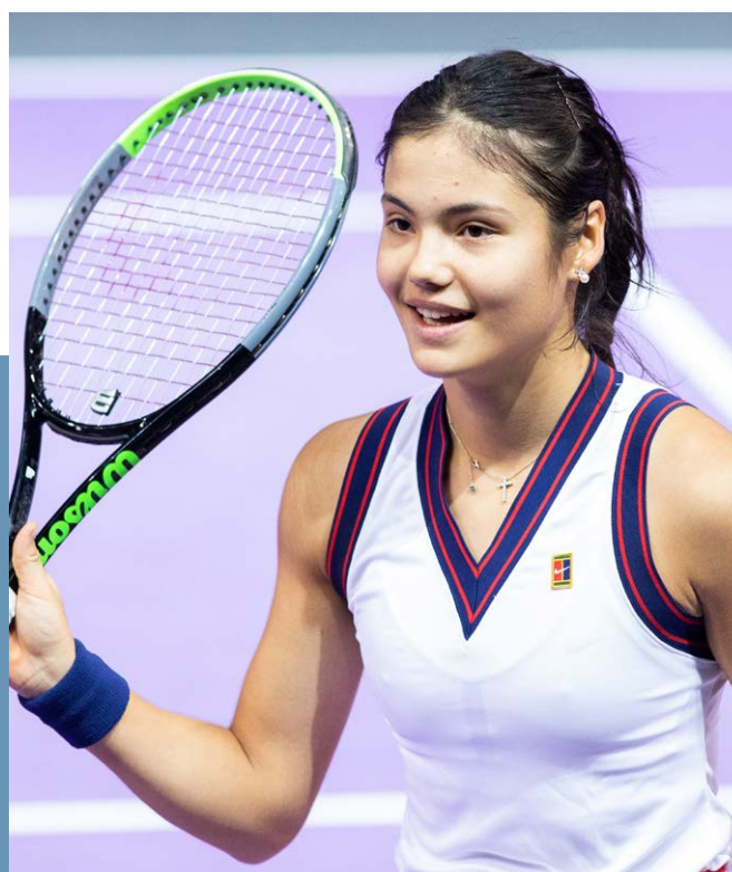
Emma Raducanu in action during a match at WTA Transylvania Open International Tennis Tournament. Cluj-Napoca, Romania. 25 October 2021

The Wimbledon website is a good source of ticket and event information.